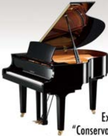
Exclusive Yamaha "Conservatory Collection" Grand Piano Dealer for New Brunswick

Thank You for Supporting Your Locally Owned Music Store